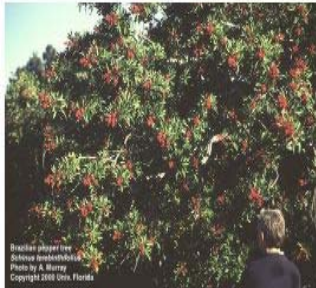
Brazilian Pepper pictured above

* For a complete list of exotic invasive plant material visit the Florida Exotic Pest Plant Council at: http://www.fleppc.org/