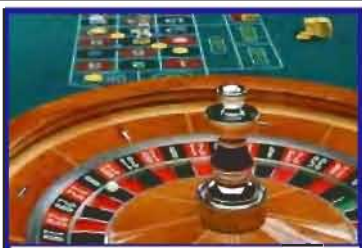
Gambling Cruise - Sterling Casino

Acquisition of the Wincey Tract will make it possible to complete a circular road through Central Winds Park with two different points of access. This will vastly improve the flow of traffic through the park. The acquisition will also provide additional badly needed parking areas and expanded space for larger community events such as the Annual July 4 th Celebration. A small portion of the property is being set aside for the future site of an irrigation water treatment and storage facility.