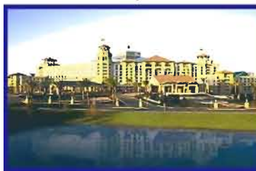
Gaylord Palms Resort