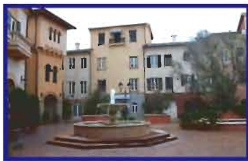
Portifino Bay Resort

Bus will depart the Winter Springs Senior Center at 9:00 a.m.